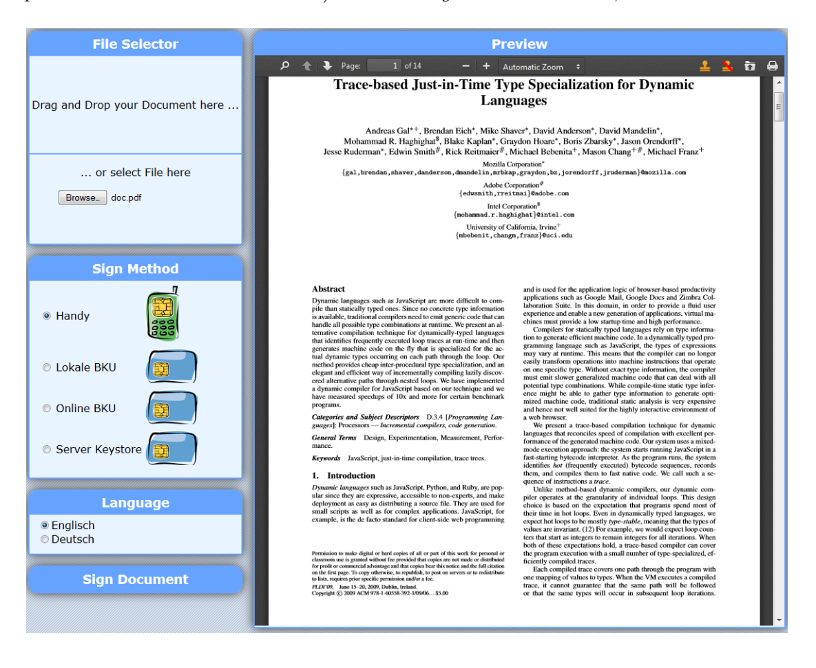
Figure 2: Updated PDF-AS Web online presence

As already mentioned in Section 1.3, HTML5 + CSS3 was used to recreate PDF-AS Web's web interface. The new website consists of several different parts and is illustrated in Figure 2. The File Selector section is here to let a user select the PDF document that he wants to sign. He can either choose to select the PDF file via the traditional HTML file selector element (i.e. press on "Browse...") or just drag and drop the PDF file from his file manager into the dropzone (upper part of the File Selector section). Via the Sign Method section, a user can choose